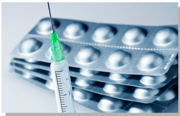
Safety Assessment of Extractables and Leachables from Pharmaceutical Packaging and Delivery Devices

SciScout develops and provides chemical, pharmaceutical, biotechnology and related companies with assessment reports that evaluate toxicity and human health risk of product impurities and other compounds.